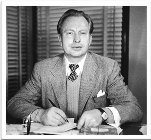
L. Ron Hubbard

Originally developed by Mr. Hubbard for use in Scientology churches, it was applied by business professionals to commercial organizations. Due to its consistently stellar results, its popularity spread and today has been used in more than 170,000 companies in 71 countries.